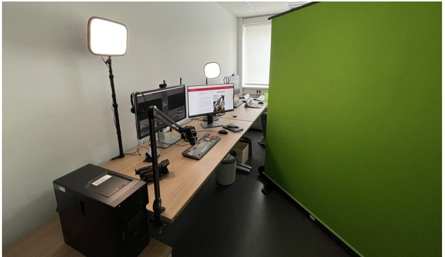
Fig. 4: Ensure that the necessary technical infrastructure is available. Here, a workstation for recording and editing teaching videos in the Media Lab of the »Interprofessional lab of teaching and learning for health and human services · Osnabrück« (ILTHOS) is shown.

Grades and Exams: It should also be clarified in advance whether all students need a grade to pass the seminar and if so, how the exams should be structured. In the Global Classroom in cooperation with Ankara University students were required to take an oral exam or to write a term paper. The exams were administered and graded by the lecturer at the student's respective university.