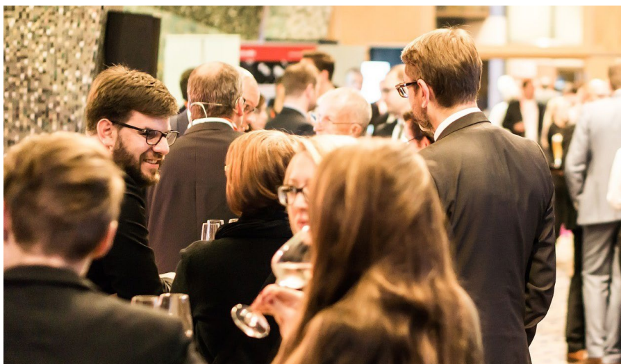
Fig 2: Cooperation partners can be found in various ways. One possibility is international conferences to get to know potential partners

For planning and conducting a Global Classroom seminar, cooperation with international partners is a key element of the virtual teaching format. International partners can be found through already established networks, for example existing Erasmus partners and research cooperations. If no suitable existing cooperation partners are available new partner can be found, for example through participation in international conferences and workshops. In the case of the Global Classroom seminar with the University Ankara, the joint classroom could be built on a long existing cooperation in research and teaching. The existing relationship of trust was helpful for planning and conducting the Global Classroom seminar. Generally, it is easier to establish such collaborations within a discipline. However, experiences from the IFIT project ( www.ucc.ie/en/ifit/ ) with so-called »Innovating Field Trips Virtual Student Project Weeks« also show that interdisciplinary cooperation can be quite fruitful, as students then learn to combine knowledge from different disciplines in the seminars.