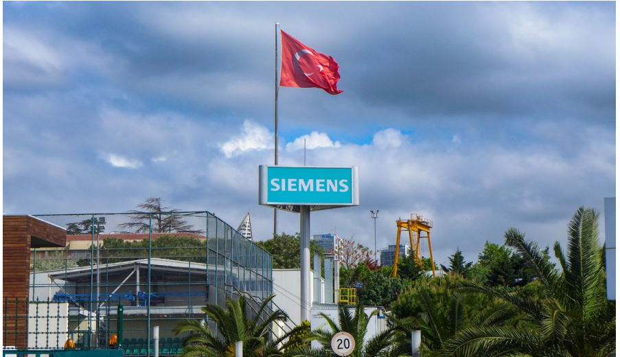
Fig 3: A wide variety of topics can be covered in Global Classroom teaching formats. The Global Classroom seminar in cooperation with Ankara University focused on the topic of globalization using the example of German-Turkish economic relations.

Target group: An important question that needs to be answered during the preparation phase, is who the target group of the course is. It must be clarified in advance to which students in what phase of their studies the course should be aimed. In doing so, not only the students' prior knowledge of the subject should be considered but also their language skills.